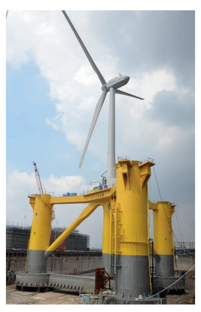
Fukushima future: 2MW offshore floating wind turbine generation facility

Increasingly, the perspective from Japan is becoming a key part of the industry dialogue. Japan has submitted a draft of new standards that take into account the impact of typhoons to the IEC, for example. Again, ClassNK plans to develop certification under the IEC standards for domestic projects covering large-sized offshore wind farms.